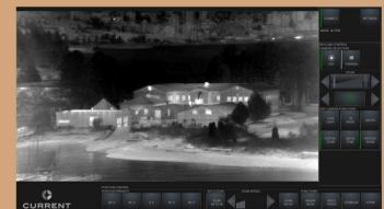
1. Video GUI