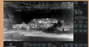
1. Video GUI