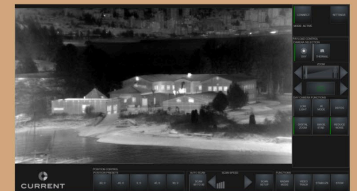
1. Video GUI