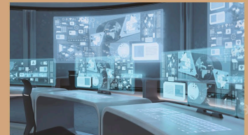
3. Protocol for interface to Command & Control System