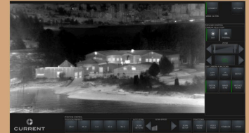
1. Video GUI