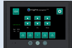
Hatteland 8" Touchscreen control