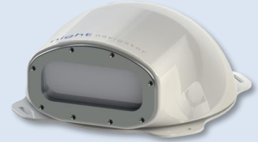
Payload platform & cables